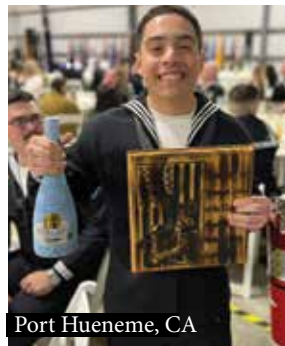
Port Hueneme, CA