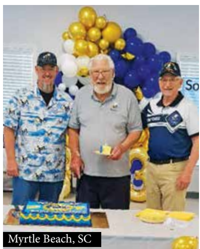
Myrtle Beach, SC