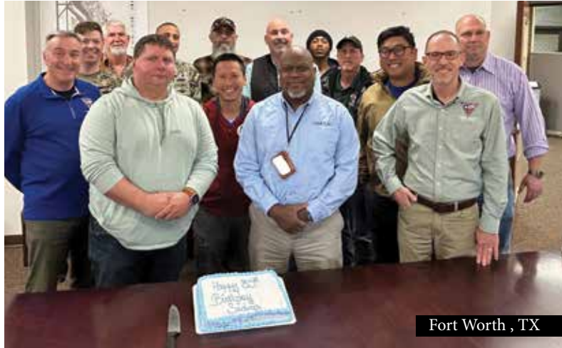
Fort Worth , TX