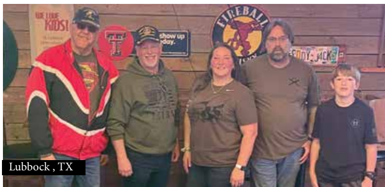
Lubbock , TX