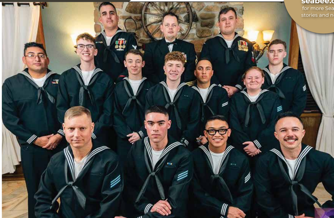
FT LEONARD WOOD, MO - Seabee Engineering Aide (EA) students and instructors gather for a group photo at the 2025 CSFE Detachment Fort Leonard Wood Seabee Ball on Saturday, March 8, celebrating Seabee heritage and camaraderie.

Want More News? Check out the digital BEE NEWS EXTRA published electronically each month. Go to seabee.org for more Seabee stories and news!