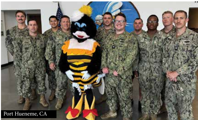
Port Hueneme, CA