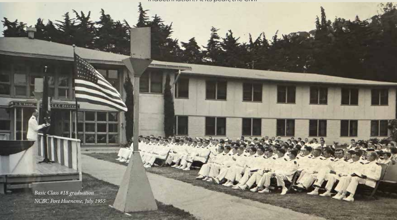
Basic Class #18 graduation NCBC Port Hueneme, July 1955

On September 1, 1946, CECOS relocated to Port Hueneme, California, where it was reestablished as the United States Naval School, Civil Engineer Corps Officers. The first class in its new location graduated in 1947, completing a 10½-week course covering naval indoctrination, public works training, and construction battalion operations. Over the years, the school adapted its curriculum to address emerging challenges, adding courses such as disaster relief engineering in 1949 and leadership training for Senior and Master Chief Petty Officers in 1968.