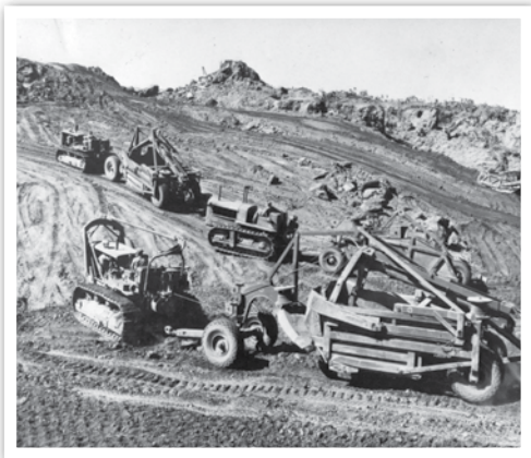
Seabees with 62nd Naval Construction Battalion working around the clock to build an airstrip and camp areas on Iwo Jima.

Throughout the brutal 36-day battle, Seabees demonstrated their legendary “Can Do” spirit under relentless enemy fire, ensuring the Marines had the infrastructure needed to sustain the fight. Assigned to the 133rd Naval Construction Battalion (NCB), these skilled builders turned warriors played a pivotal role in enabling the success of Operation Detachment.