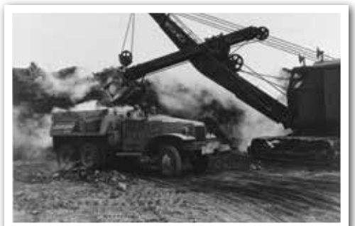
A power shovel lifts volcanic ash and stone, while loading 62nd Construction Battalion truck amid a steamy Iwo Jima landscape, March 1945

We Build, We Fight—Then, Now, and Always.