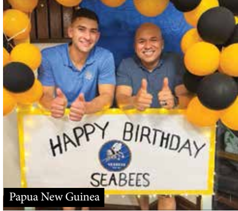
Papua New Guinea