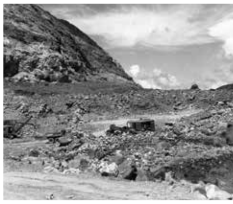
The 31st Naval Construction Battalion uses power shovels in a rock quarry at the foot of Mt. Suribachi, Iwo Jima.

Landing on Iwo Jima with the first assault waves, Seabees immediately went to work repairing shell-torn beaches, constructing vital roads, and clearing obstacles under enemy bombardment. They braved withering fire to establish makeshift airstrips, ensuring that emergency aircraft could land and evacuate the wounded. The 133rd NCB repaired