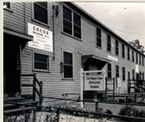
(Below) The original CECOS in Davisville, Rhode Island, was created on May 1, 1945 to consolidate the officer's indoctrination and training courses with the Navy Public Works Officers training.

The 1970s saw the introduction of courses on energy management and environmental protection to address national and global concerns. In 1959, CECOS expanded its international reach by training officers from allied nations under the Military Assistance Program (MAP). Officers from China, South Korea, Turkey, Japan, and Great Britain attended training, strengthening their naval engineering capabilities. This international exchange continued into the 1980s under the Mutual Defense Assistance Plan (MDAP), with officers from South Korea, the Philippines, Iran, and Thailand undergoing instruction at CECOS. Today, officers from allied nations such as South Korea and Japan still attend CECOS courses.